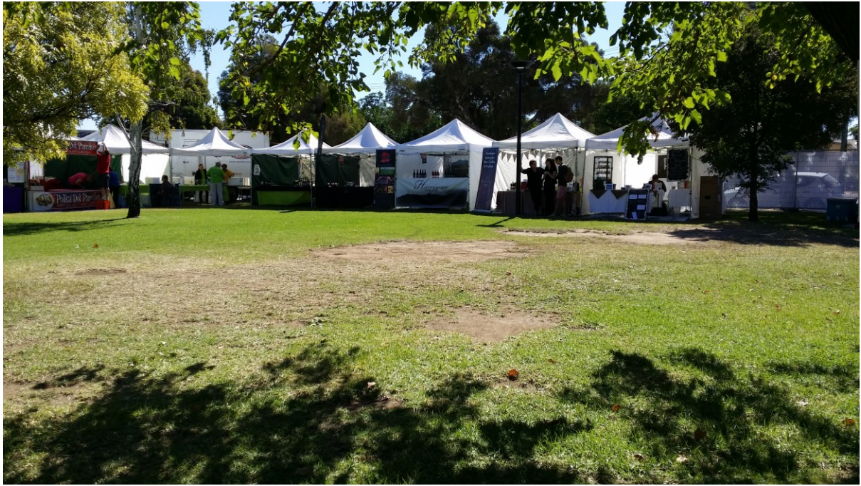
Figure 4 Harrisons Pinot Stall prepared for customers at the Wagga Food and Wine Festival