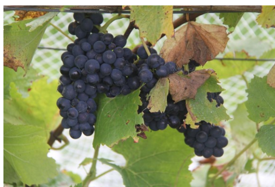
Figure 1 Sun rising over tranquil waters in Bridport. Fruit on vines at Easter